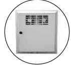
Optional door - Mounted fan keeps equipment cool.