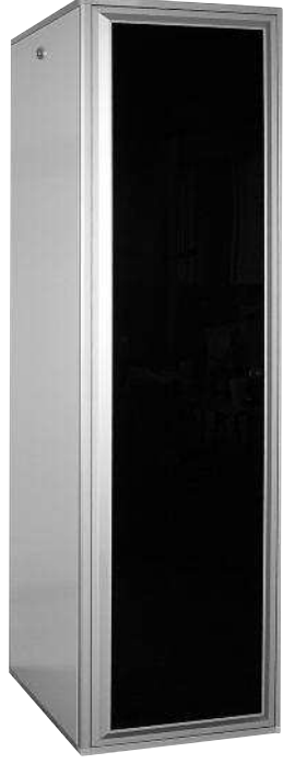
Requires only 24" (610 mm) of floor space!