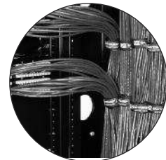
Unique fins support large bundles of cable

800-834-4969 in U.S. & Canada • www.chatsworth.com