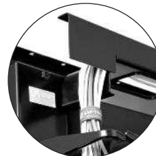
Integrated top jumper trough provides smooth transition

X=color: 7=Black, E=Glacier White. 55100-703 and 55104-701 available in black only.