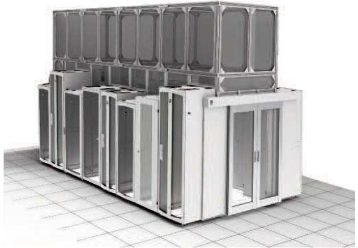
Fully Assembled Built To Spec (HAC) Solution.

This document lists service parts for the Build To Spec Kit Hot Aisle Containment (HAC) Solution including components of the Built To Spec Kit (33000_CUT) and the Full Height Cabinet Blanking Panel (33002_CUT). Service parts include extrusions, brackets, panels and edge seals and are used as replacement parts or to update the solution as cabinets/applications change.