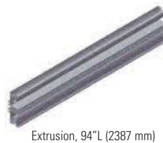
Extrusion, 94"L (2387 mm)