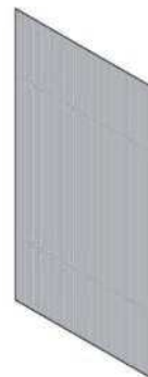
Panel, 48"W (1219 mm) x 96"L (2438 mm)