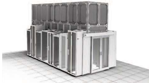
Build To Spec Kit (shown assembled over cabinets) is field-fabricated. Each kit includes the following components.