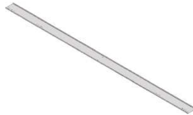
Double Door Floor Mounting Template