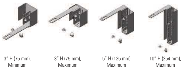
3" H (75 mm), Minimum