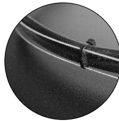
LCD Monitor+Shelf features integrated cable management