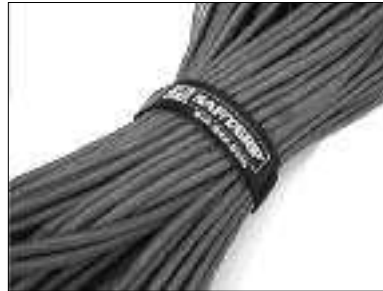
Open Loop Series

Used to strap together free hanging computer cable for a tangle-free installation. Strap is held in place by a loop that adheres to one cable. Simply peel the hook and loop sides apart to remove strap.