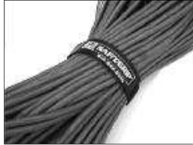
Open Loop Series

Used to strap together free hanging computer cable for a tangle-free installation. Strap is held in place by a loop that adheres to one cable. Simply peel the hook and loop sides apart to remove strap.