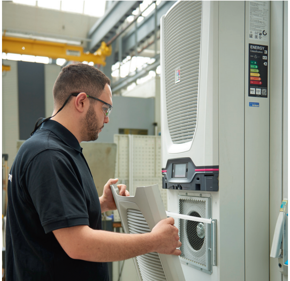
Figure 3: Retrofitted with savings: After the conversion to the new Blue e+ chiller generation, more than 70 percent or 25,000 euros per year in energy costs were saved.