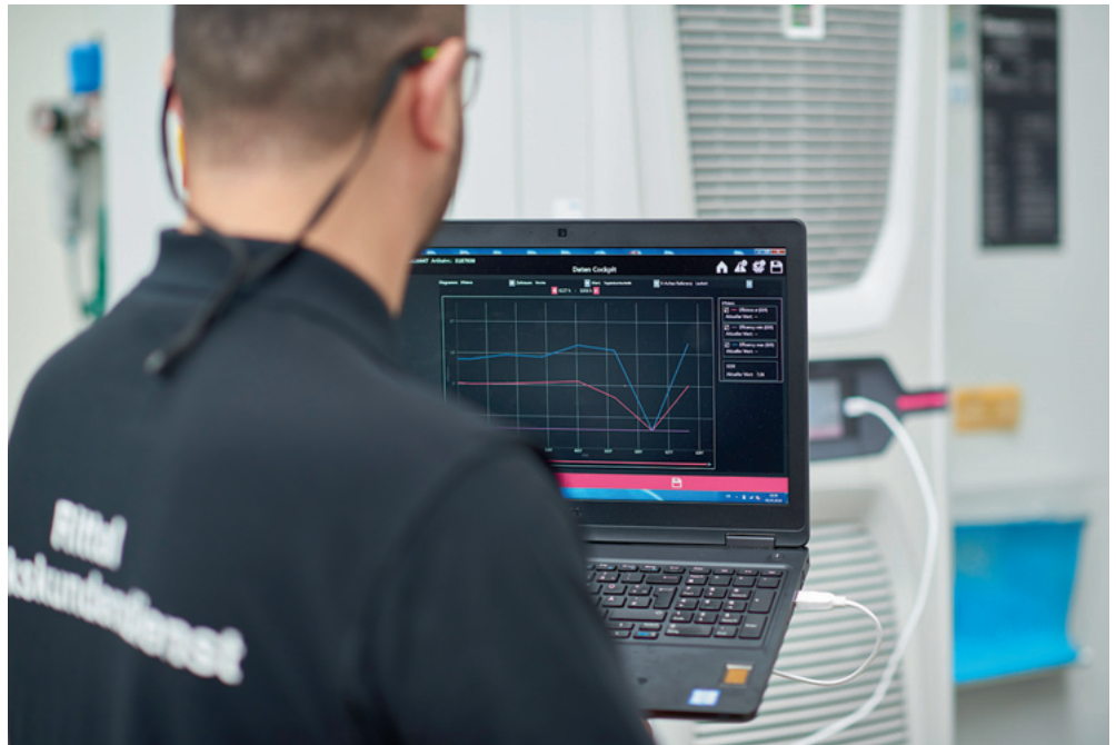
Figure 2: Everything in sight: An employee from the Rittal Manufacturer's Service checks the current efficiency values of the Rittal Blue e+ cooling units at Voith Turbo in Heidenheim.

Operators of enclosure cooling devices must make regular professional maintenance a high priority. This is because only reliable enclosure climate control protects the investment in the system and ensures that electronic components are protected from overheating while processes can run smoothly and safely. Emissions are prevented through the routine inspection and maintenance of existing systems with F gases, as well as the recovery of the gases at the end of the system's service life.