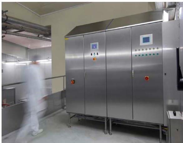
Figure 3: The Rittal TS 8 stainless steel bayed enclosure system is used in the food industry in numerous applications.

In stainless steels, resistance to corrosion is also associated with a high level of toughness. This means that such steels can be machined much less easily than other types of steel using mechanical cutting procedures. Shorter tool service lives and a higher machining time lead to significantly higher costs if the same component is to be produced from stainless steel by metal-cutting methods. On the other hand, stainless steel can be easily formed without cutting. Enclosures made of sheet steel can therefore be produced relatively easily. Today, the use of stainless steel is common in many areas where corrosion resistance is important. Typical examples are the manufacture of housings or enclosures for the chemical and food industries or for medical technology.