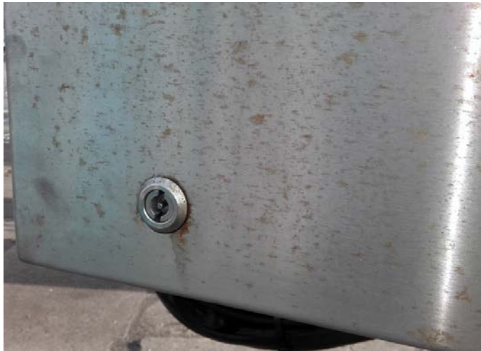
Figure 4: Example of red rust on stainless steel

The term “stainless steel” suggests that components manufactured from this steel do not corrode. However, there is no guarantee that stainless steel will not rust under any circumstances. For example, the 1912 patent application refers to the process simply as the “production of articles ... that require a high resistance to corrosion ...” [DEU] In this respect, the term “stainless steel” is somewhat misleading, although actually, stainless steel does not rust under most conditions.