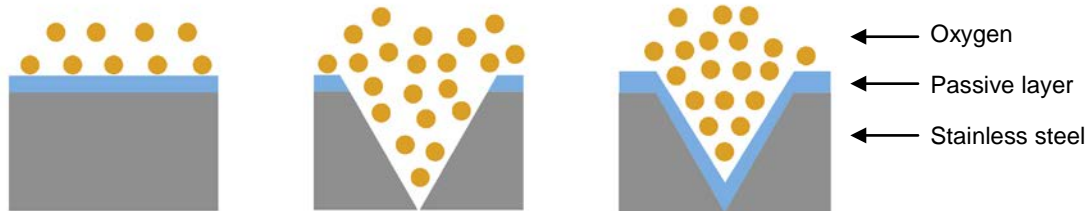
Figure 2: Self-healing passive layer

quickly, so restoring the previous level of protection. This is referred to a “self-healing surface”.