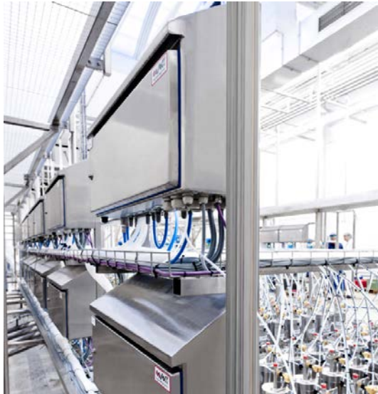
Figure 1: Rittal stainless steel enclosures deployed at Friesland-Campina.

This Whitepaper discusses the function of stainless steels and their use in enclosures and housings. First, the paper examines just what “stainless” exactly means, as well as which chemical processes promote this property. Another issue dealt with is why stainless steels can still exhibit traces of rust under certain conditions, and how this can be effectively prevented. The aim is to give the user a comprehensible guideline to help him/her select the correct enclosure for the on-site ambient conditions.