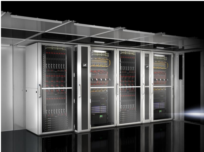
Figure 2: Rack and row cooling in a contained aisle

The server room and its air conditioning system must also be assessed. The expected delay before the room becomes overheated will depend on various technical factors. Should this period of time be used solely to perform a controlled shutdown of the servers? An alternative would be to switch off only some of the servers, so that critical applications can keep running on the others. Automation is required to handle this option, too.