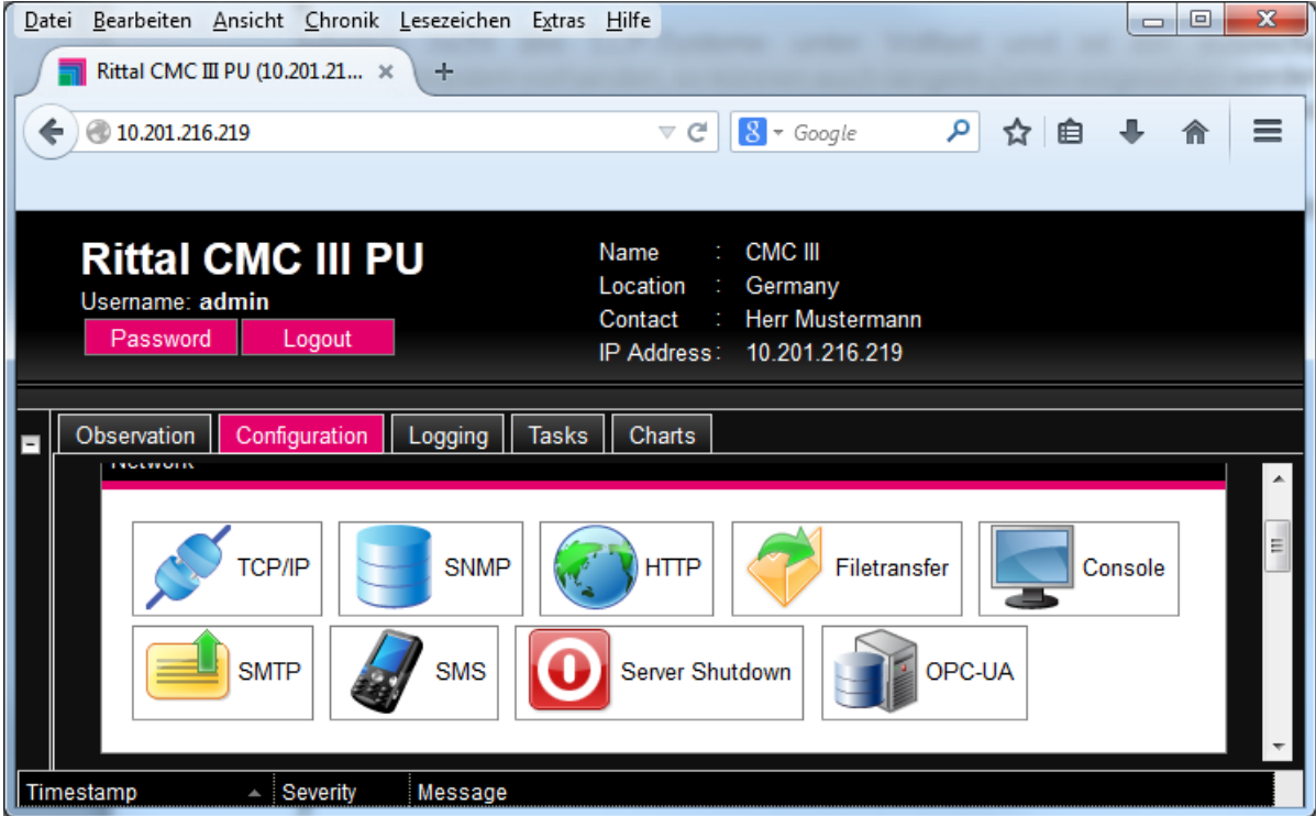
Figure 8: Configuration screen of the CMC III