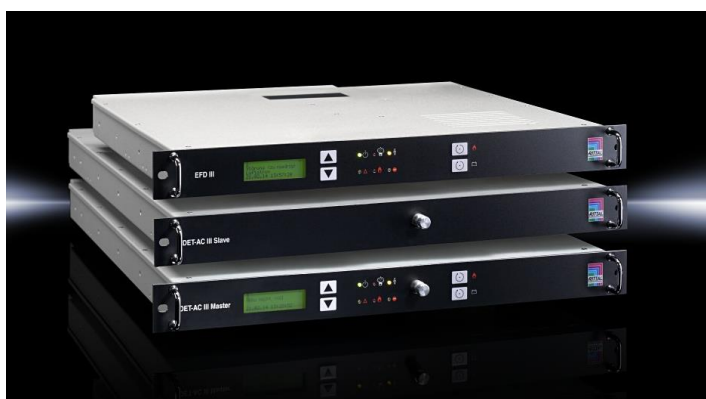
Figure 9: the DET-AC III rack extinguisher system

The extinguisher system (e.g. DET-AC III – see Figure 9) and the controller of the door automation system are connected to a CMC III system. The logic settings are configured to determine whether the extinguisher system has issued a fire alarm. The doors may only open automatically if no fire alarm has been activated. This rule can easily be linked to the CMC III task settings.