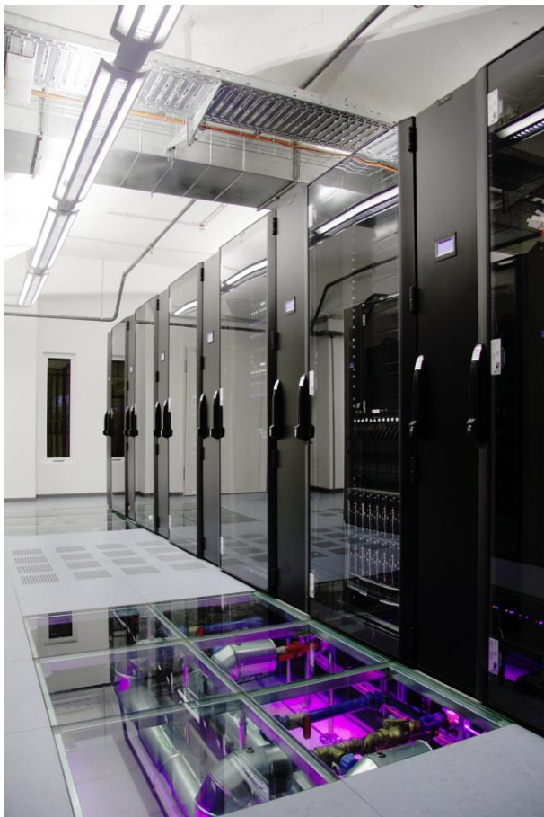
Figure 1: Rack cooling with LCPs

This is only feasible if the room is large enough and the air conditioning system has sufficient capacity.