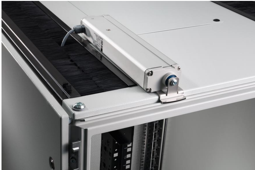
Figure 6: Door kit extension

Servers with powerful fans can exert such a large inward force on the front doors that they cannot open automatically. This very strong partial vacuum can be overcome with a spindle motor (see Figure 6, Figure 7). The spindle is slowly extended outwards by about 20 cm and pushes open the door at the side until the pressure is equalised. The door starts to open and is pushed wider open by the spring dampers described earlier. The same mechanism can be fitted on the rear door if the cooling system draws in the air at the rear. As a partial vacuum can be expected in practically all server applications, the door kit extension is always recommended for these applications. As the motor requires power, it must be connected to the server voltage supply or to a UPS unit.