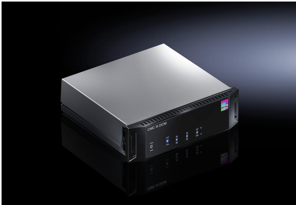
Figure 3: The CMC III system's Door Control Module

This controller automates the opening and closing of a rack's front and rear doors. It can be connected to the LCP cooling system or the Computer Multi Control (CMC) III rack-monitoring system. The CMC III monitors the physical environment around the IT equipment and automates appropriate action in response to problems.