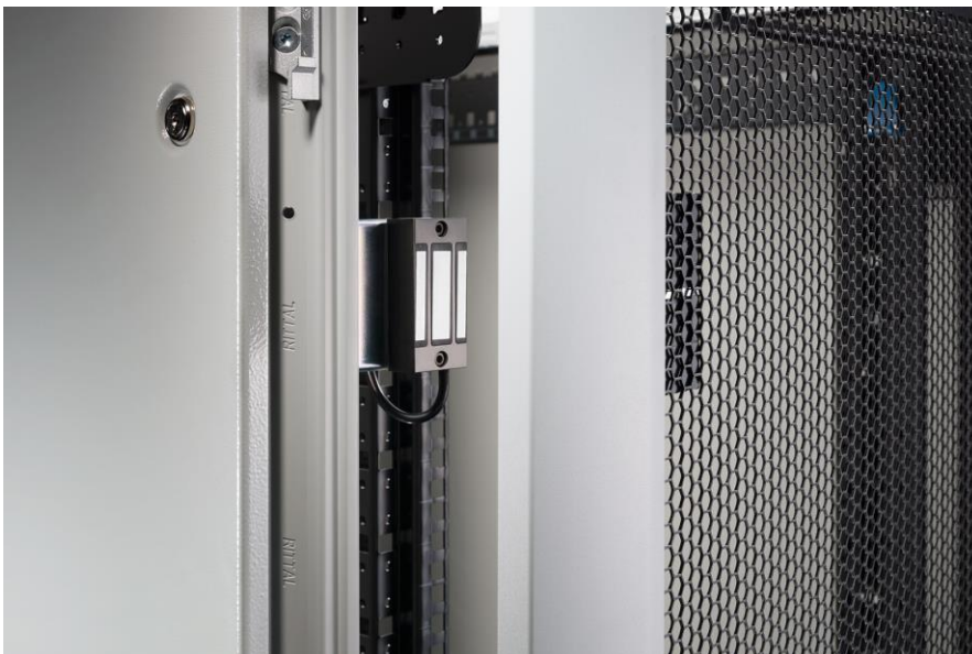
Figure 5: The system's magnetic catches

Normally, the door is kept open with a spring damper. The spring forces are kept small, ensuring that the system closes easily and eliminating the risk of injury to users.