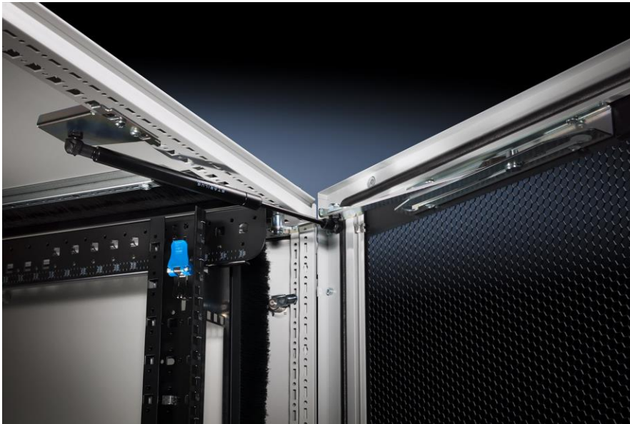
Figure 4: Door kit for the door automation system

Normally, the door is kept open with a spring damper. The spring forces are kept small, ensuring that the system closes easily and eliminating the risk of injury to users.